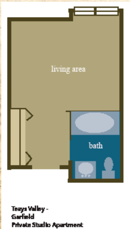
Teays Valley - Garfield Private Studio Apartment