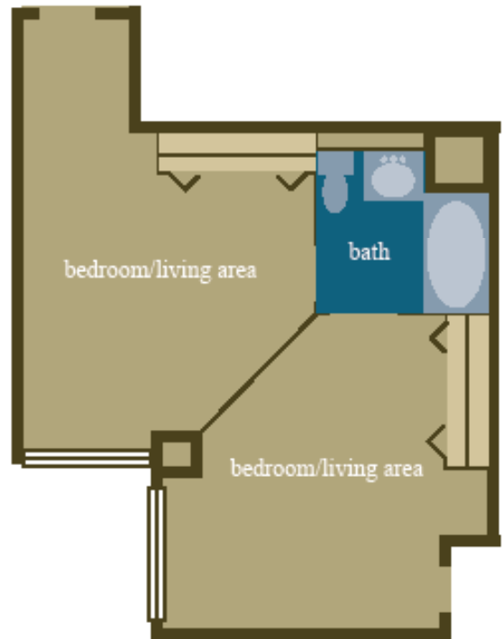
Teays Valley - Jefferson II Semi-Private Studio Apartment